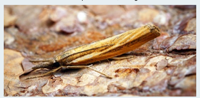
Agriphila tristella by Bennyboymothman CC BY 2.0.

1,355 moths were recorded in 167 squares (116 BC and 51 BBS), which comprises 20% of all squares surveyed (-1% points compared to 2021). In total moths of 83 species were recorded (six more than in 2021). The most numerous moth was the micromoth Common Grass-veneer (Agriphila tristella), accounting for 26% of all moths seen. However, the Silver Y remained the most widespread moth, being recorded in 17 %