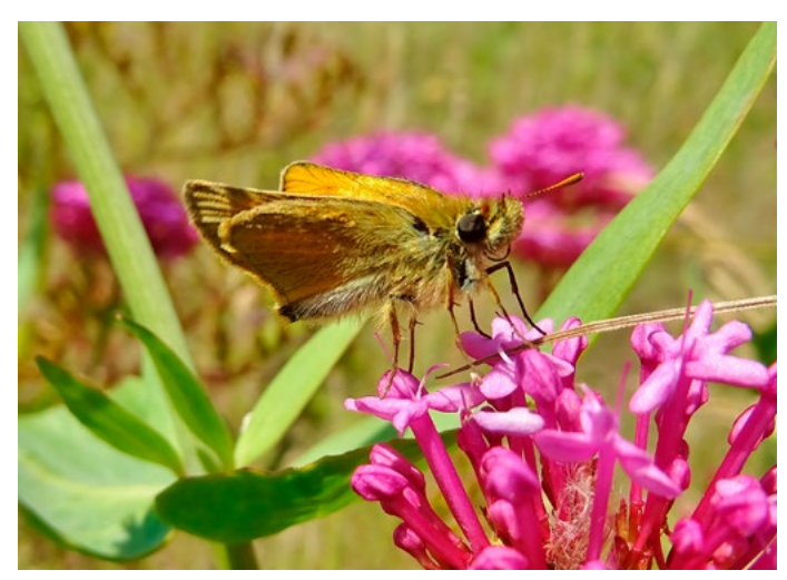
Small Skipper by Emma Smart.

There are a number of BC events coming up this spring and summer that WCBS recorders may find interesting; many of which are online, please check the Event pages on the BC website.