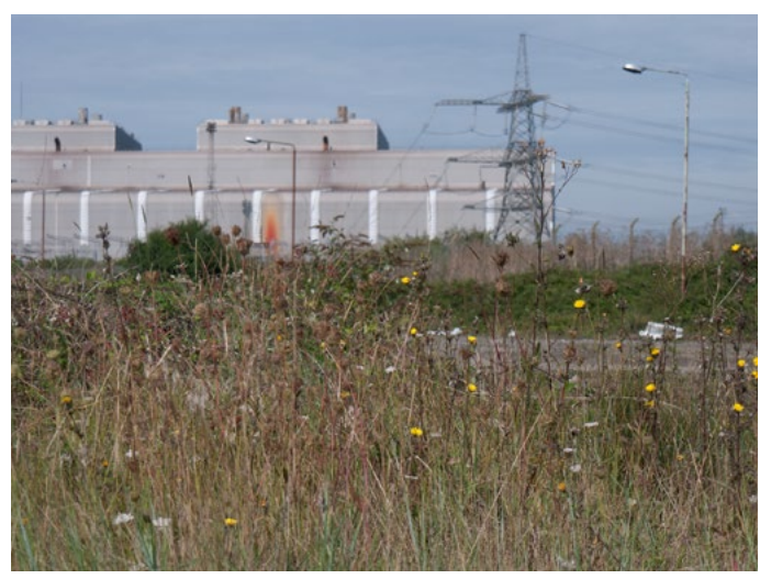
Post-industrial sites (40) can be a haven for rare plants as well as butterflies and other invertebrates.

Data from locations such as these will prove invaluable as we are able to learn so much more about how butterflies are faring in the wider countryside.