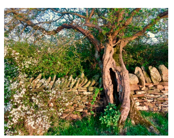
Veteran Hawthorn