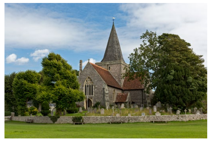
Churches, parks and gardens (39) are surprisingly under recorded.

So, don't be shy, get online at UKBMS and maybe even choose a new urban transect to do. The main thing is to record your transect habitat, even if it is only your best guess, as this will give everyone involved in the survey a large dose of Habitat Happiness.