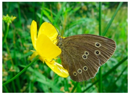
Ringlet by Donna Rainey.

The overall busiest day for recording was 29th July when 62 visits were made, recording 3,499 butterflies of 32 species. The most visits made to a BBS square were nine to a square near Hilton, County Durham. The most visits to a BC square were 14 to a square near Benhall Green, East Suffolk.