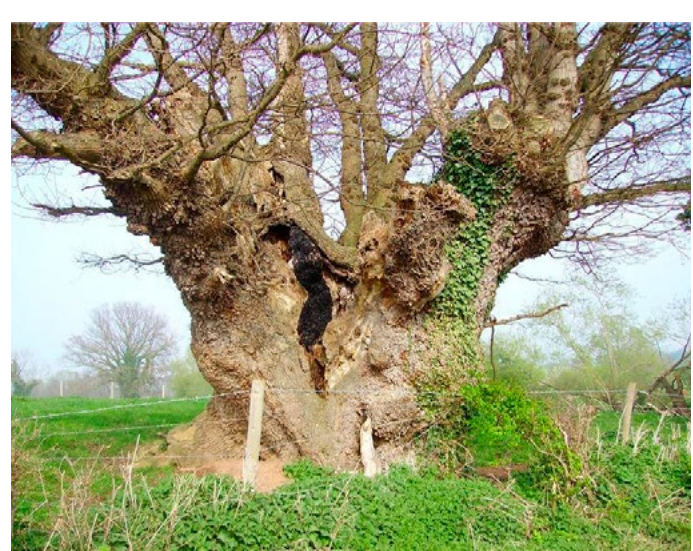
Ancient oak