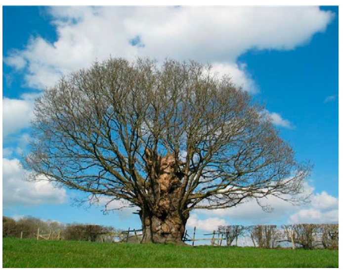
The Pen y Maes Oak