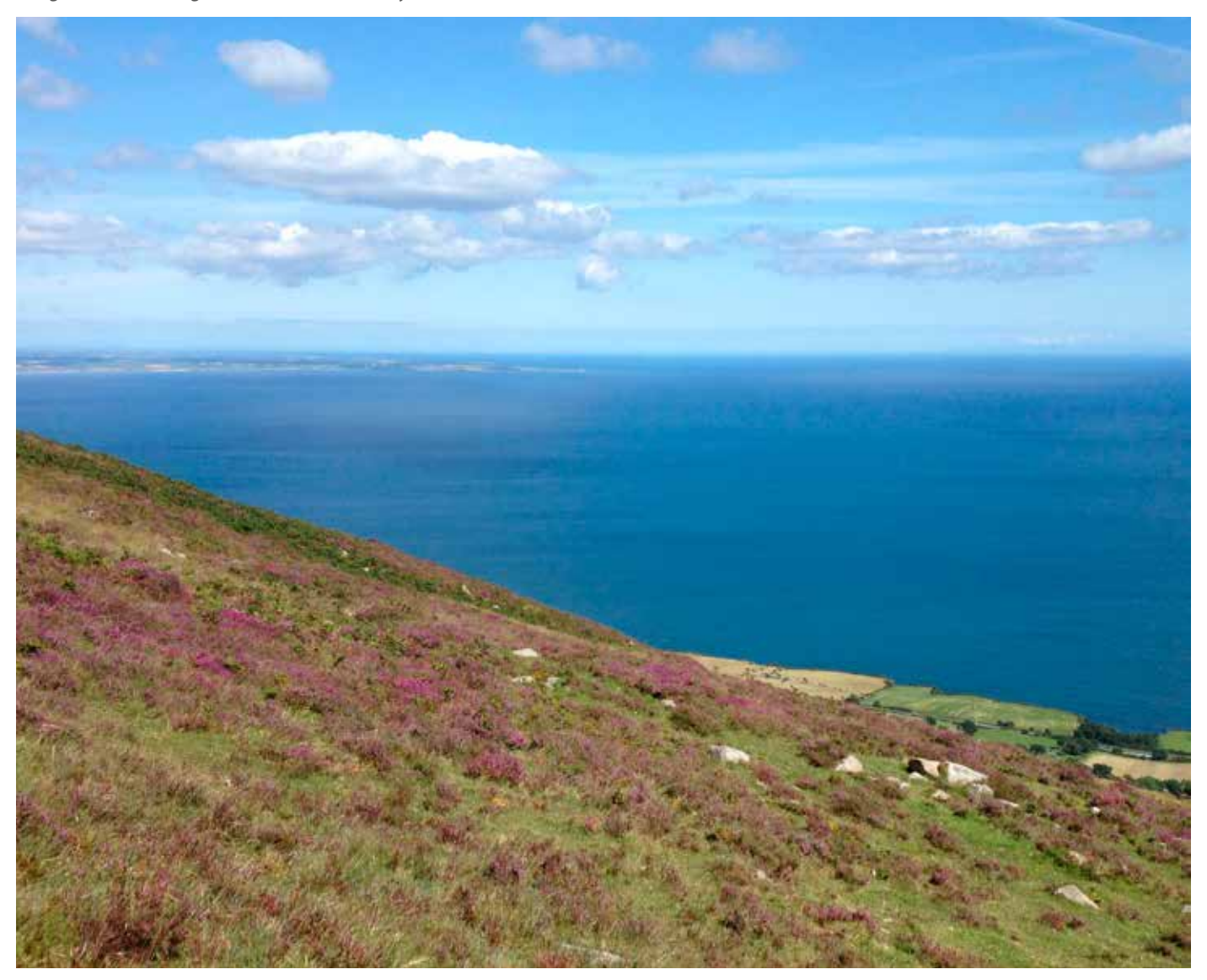
Long Mountain 8 August 2017

Conclusion: An OS map is essential for any volunteer. As well as preparing before a visit, I have found general features like pylons, quarries, way marked walks and parking useful in the field. They are a godsend when searching for sections of path or fence boundary on remote sites. I would also include local knowledge and ensuring all volunteers have basic map reading skills as essential tips for Branch Champions!